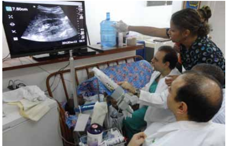
RAD-AID in Latin America

partnerships, respectively” (Sustainable Development Goals 2016).