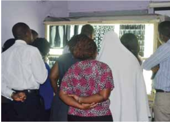
RAD-AID in Africa