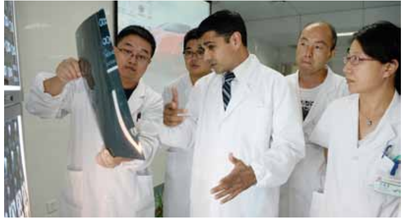
RAD-AID in Asia