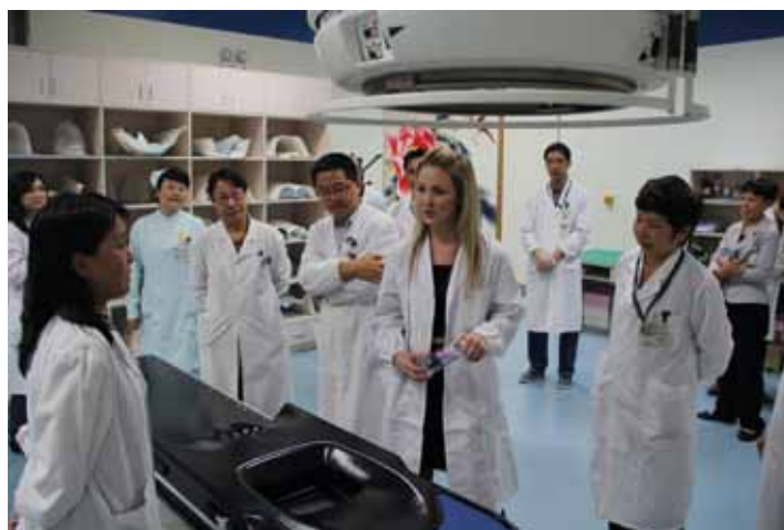
RAD-AID Radiation Therapy