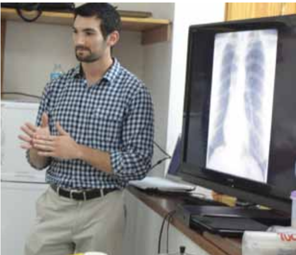
RAD-AID in Haiti