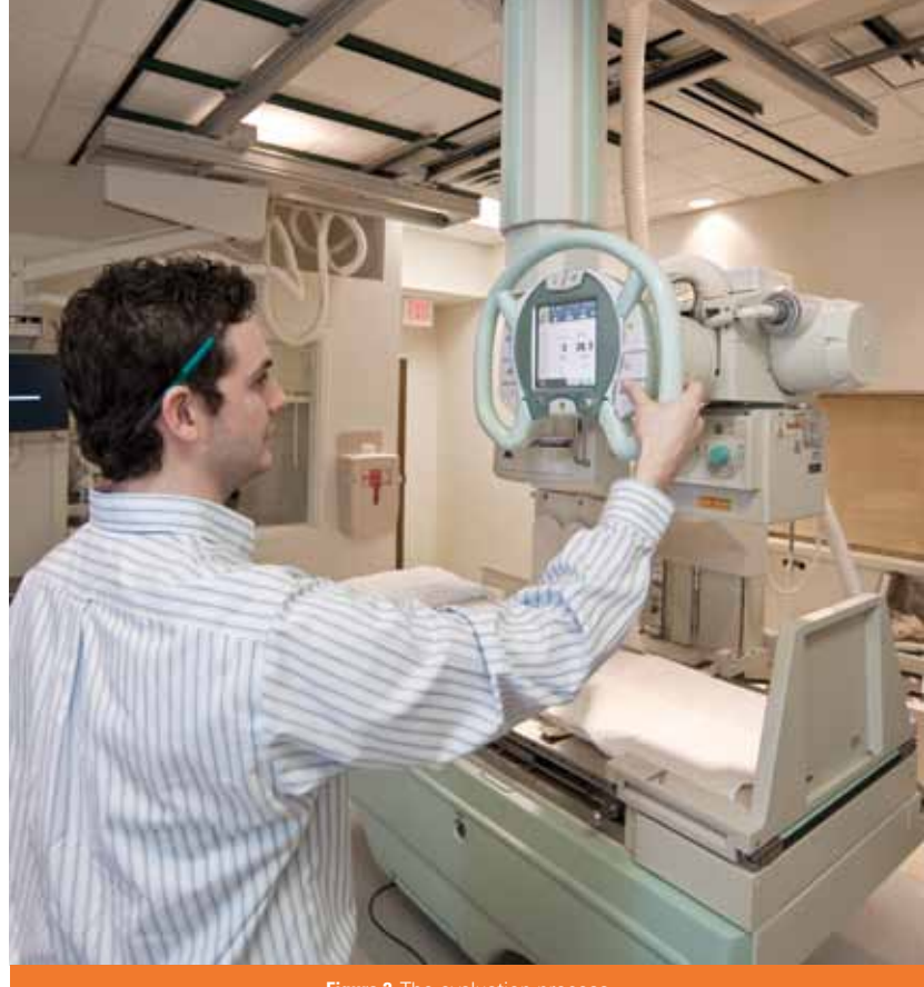
Figure 2. The evaluation process

Otherwise, without a strategic equipment plan in place, often the "squeaky wheel gets the grease." This expenditure is too costly to leave to chance.