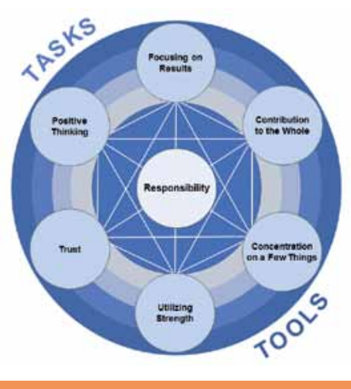
Figure 1. "Principles of Management"

To ensure clear and concise management knowledge, a common understanding of the elements of this profession is fundamental. Uncluttered management thinking means to sieve out the necessary and sufficient elements that all managers must control in any location, in any situation, in any organisation, and at all times. Management principles are one of the elements of management as a profession.