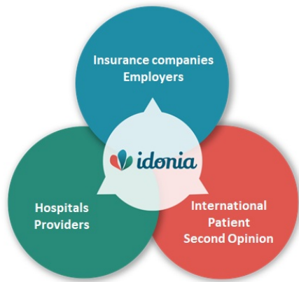
Figure 2. Idonia as a middleware in healthcare

One of the initiatives Idonia has undertaken is strongly linked to its purpose of empowering the final user, that is the patient. This is why the platform has been offered to individual users who want to have their medical documents in a secure cloud space. Once registered, patients can create their personal space, where they can store their documents and medical results. Thus, a patient who has had various medical tests, most likely some of them in multiple centres, could have a single space with all their results archived. For example, they could access, at any time and from any point with internet access, the X-ray that was done three years ago, the MRI that was delivered to them on a CD last month and the analysis from a specialised laboratory. This, in turn, gives the patient full control over their information with full capability to review and share.