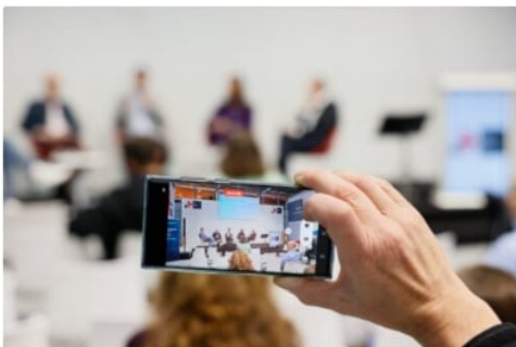
Photo: The MEDICA stage programme boasts a high-calibre line-up.