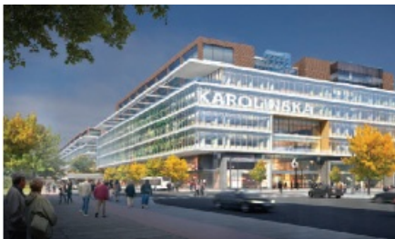
Picture 1. The corner of main building

The levels of the most eco-toxic pharmaceuticals in discharge from wastewater treatment plants or in surface water to be lower than in 2005; 25% of the chemicals and chemical products which SLL identifies as having a serious effect on health and the environment to have been phased out, and 25% of the County Council's meals to be based on sustainably- produced products.