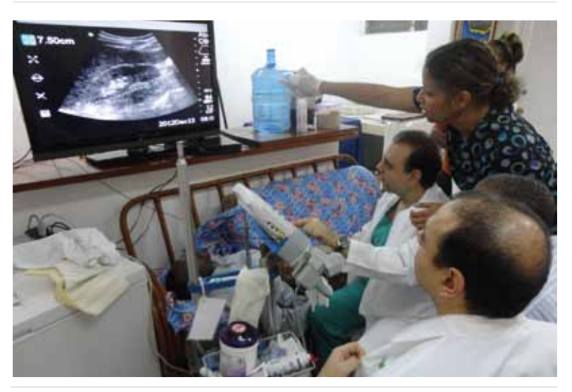
RAD-AID in Latin America

partnerships, respectively" (Sustainable Development Goals 2016).