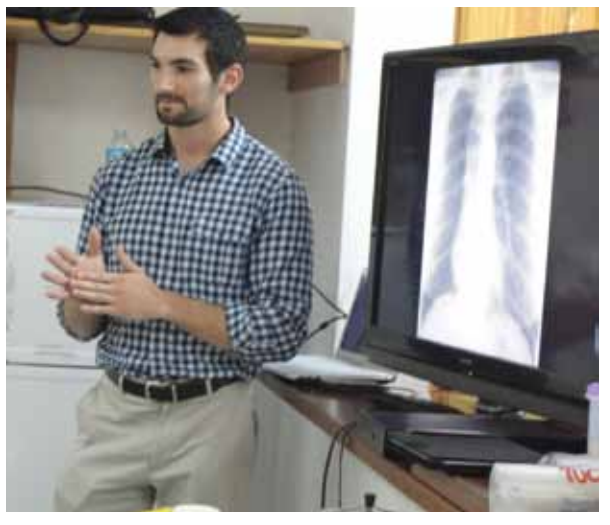
RAD-AID in Haiti