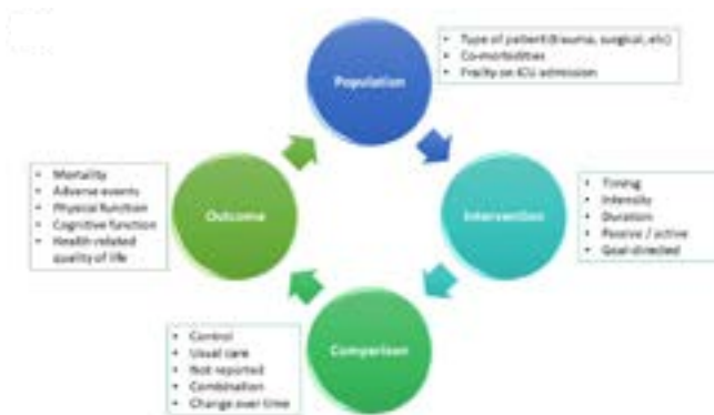
Figure 2. Heterogeneity in ICU rehabilitation studies

Other novel therapies to improve access to early mobilisation in the ICU may include interventions such as rehabilitation robotics or exoskeleton robots. Robots designed to assist in