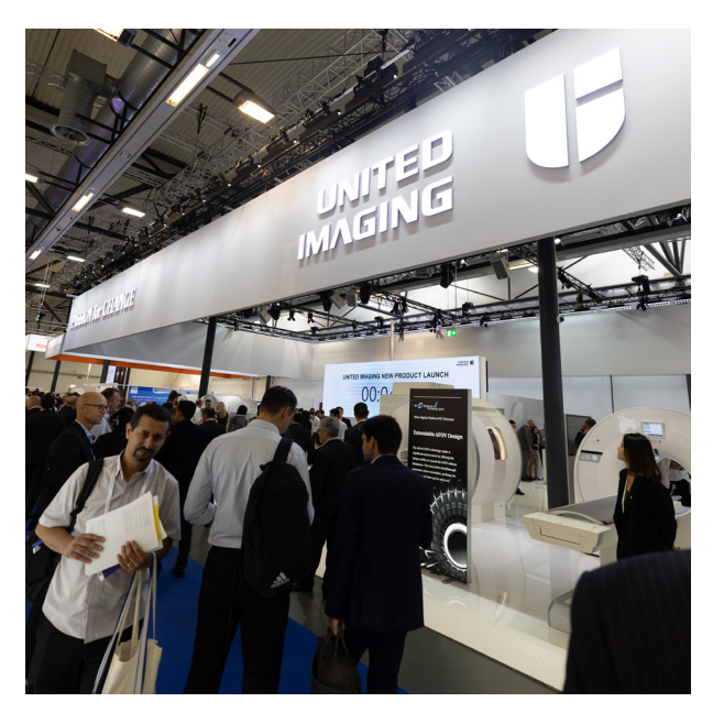
Visitors at EANM

commended NX for its potential achievements in radiation dose reduction, methodological improvements, and new brain imaging paradigms, including small brain structures imaging, low-density binding-site identification, spinal cord imaging, dynamic neurotransmitter release, and small withinsubject changes measurement.