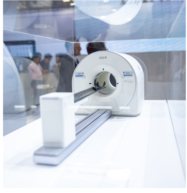
The Model of uMI Panorama GS

In tandem with uMI Panorama, the uExcel is an advanced molecular imaging technology platform meticulously integrated with hardware and software components. This platform enhances system performance, imaging capabilities, and overall