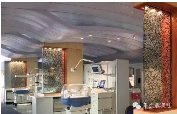
2013 ICU Design Competition Winner Ann & Robert H. Lurie Children's Hospital Chicago, Illinois, USA