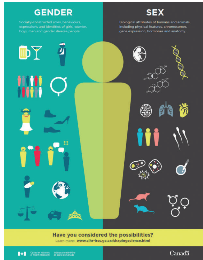
Figure 1: Sex vs. Gender

This information suggests that not only do medical schools not spend enough time addressing gender